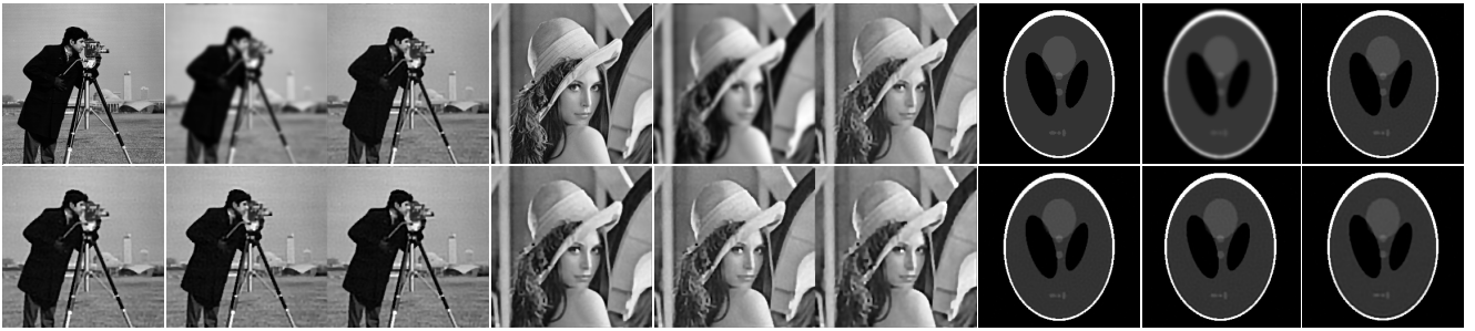
Fig. 2: Example reconstructions: For each image, 1 st row represents the original; the degraded image with a Gaussian PSF of variance 5 and the non-blind restoration result for SNR = 40 dB and 70% of CS measurements, from left to right, respectively. 2 nd row represents the blind deconvolution results, using the proposed framework, for 70%, 50% and 30% of CS measurements, from left to right, respectively.